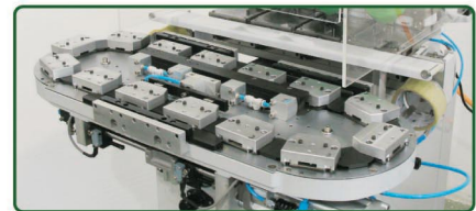
Different sizes servo drive conveyors