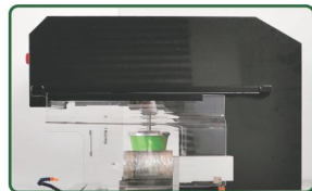
Stable granite stone machine structure