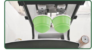
2 Independent pad cylinders