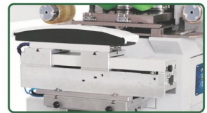
Pneumatic shuttle attachment