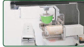
Turbo pad clean feature