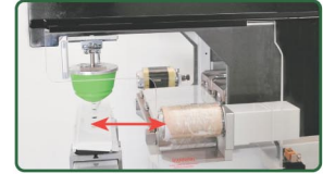
Pad in/out stroke for max. throat depth