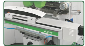
Precision servo product shuttle (DRE)