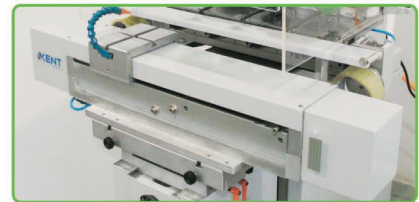
2-4 color Pneumatic Shuttle