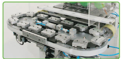
2-4 color Conveyor