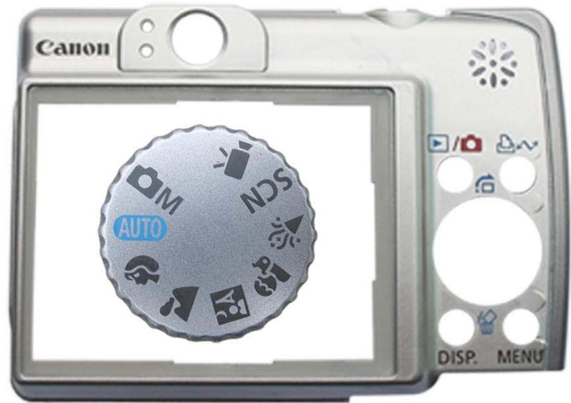
PP-150 IDS (佳能数码相机外壳) PP-150 IDS (Canon DC Cover)