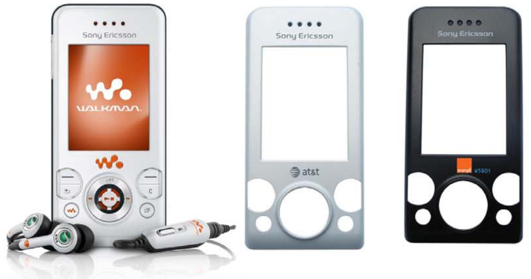
索尼爱立信手机移印系统 Sony Ericsson Handphone Printing System