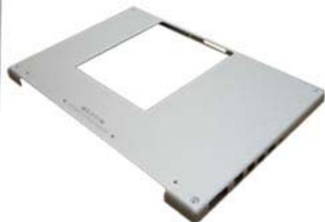
手提电脑外壳移印系统 Notebook Computer Cover Printing System