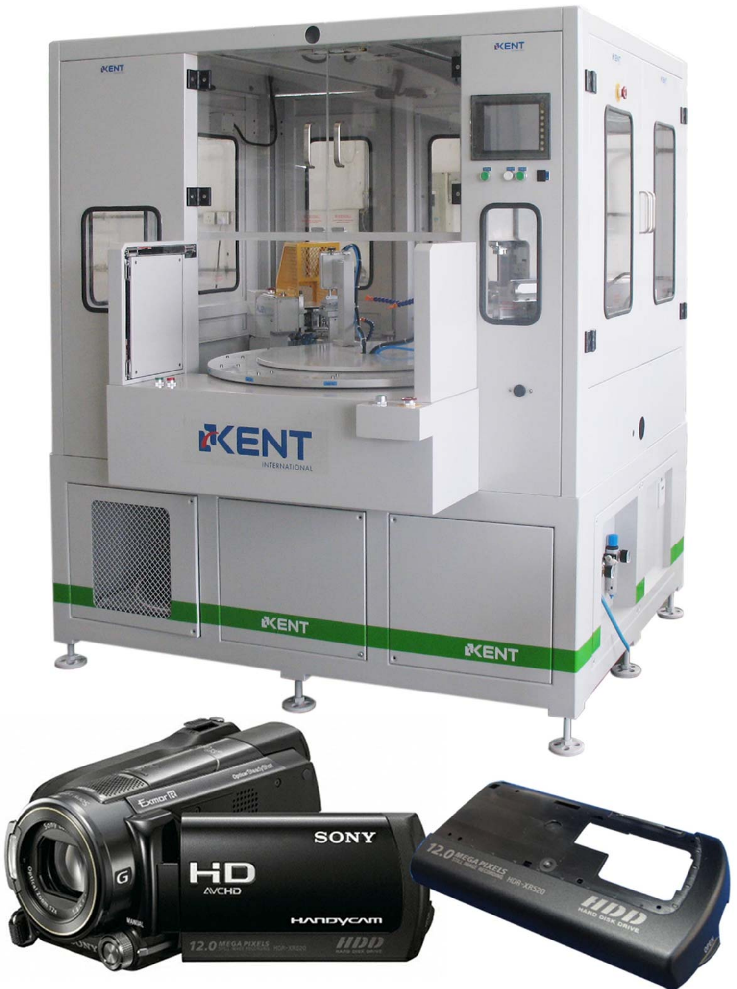
索尼录像机外壳移印系统 SONY Video Cam 2 Angles Printing System