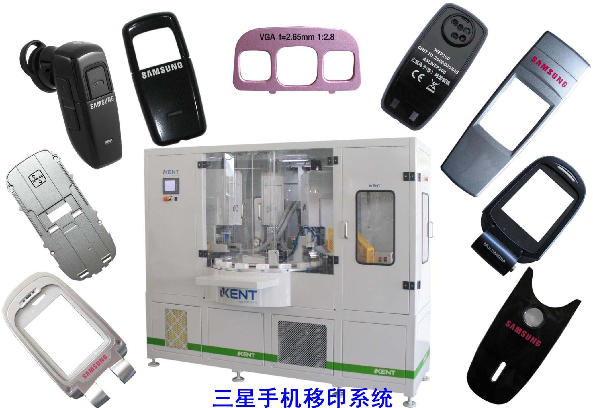
三星手机移印系统 Samsung Handphone Printing System