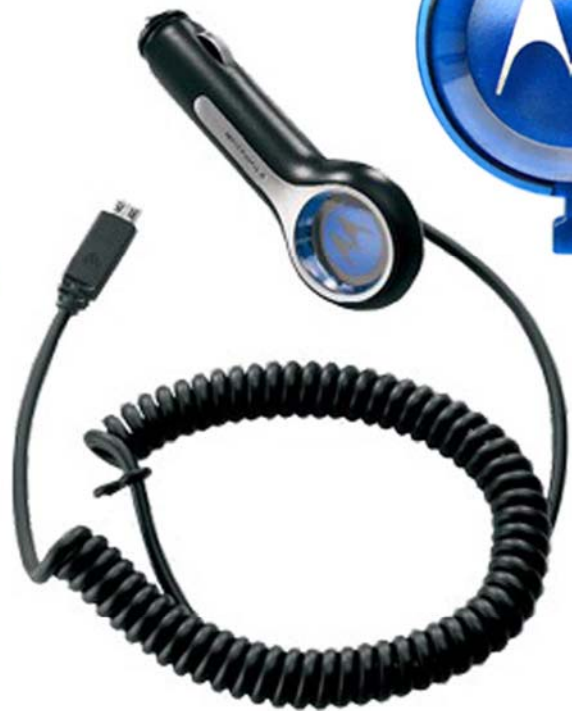
SD 内存卡及摩托罗拉汽车充电器移印系统 SD Memory Card VS Motorola Car Charger