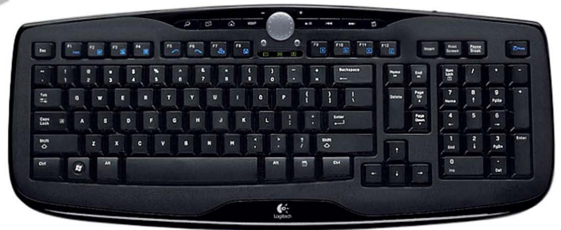
电脑键盘伺服马达移印系统 Servo Motor Keyboard Printing System