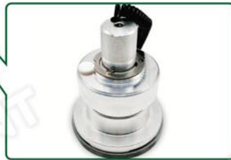
AVC - Automatic Viscosity Control (patented)