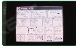
PLC control touch screen panel