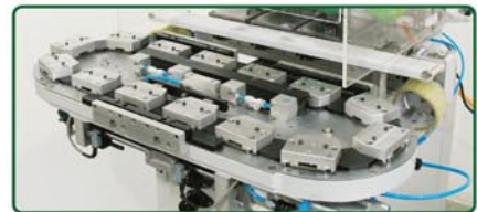
Different sizes servo drive conveyors