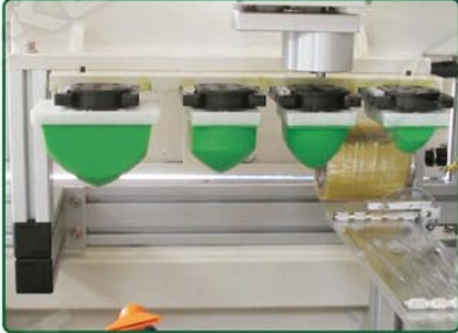
Auto pad change