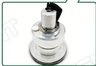
AVC - Automatic Viscosity Control (patented)