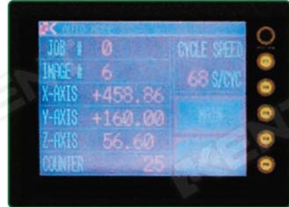
PLC control with touch screen interface