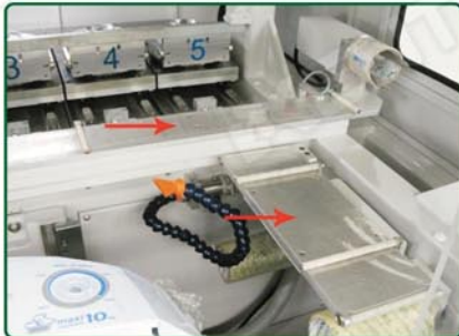
Two Auto pad cleaning attachment