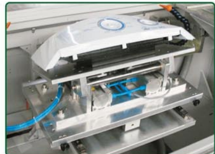
Innovative auto adjustable tilting jig for multi-angle printing