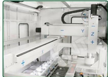
Move along X,Y,Z axis by CNC robot