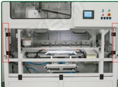
Safety light beam curtain