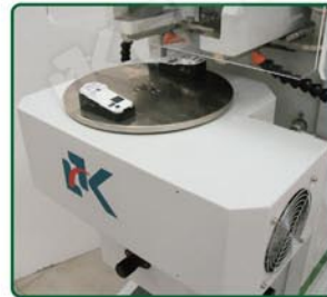
2-Station MOTOR Turntable