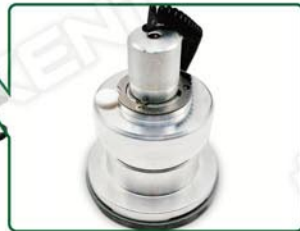
AVC - Automatic Viscosity Control (patented)