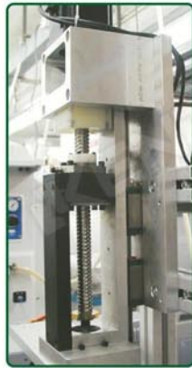
Servo motor driven pad stroke