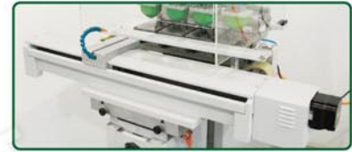
2 - 6 color digital servo motor shuttle