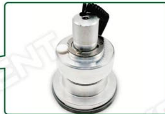
AVC - Automatic Viscosity Control (patented)