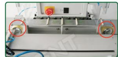
Auto pad clean