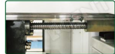
Linear guide rail