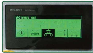
PLC control touch screen panel