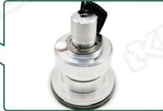
AVC - Automatic Viscosity Control (patented)