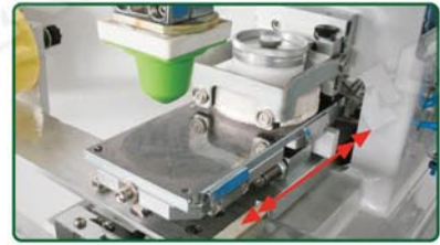
Platform in / out movement (Pad clean underneath)