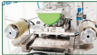
Auto pad clean