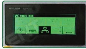
PLC control touch screen panel