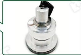
AVC - Automatic Viscosity Control (patented)