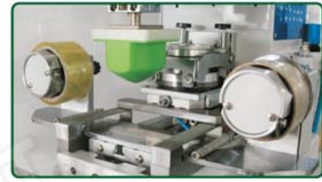
Auto pad clean