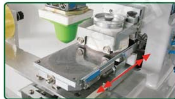
Platform in / out movement (Pad clean underneath)