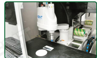
Auto product selection / pick up / loading by Robot