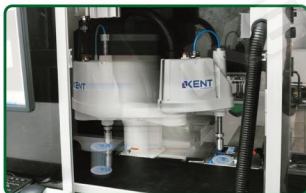
Smart pick up / unloading by Robot