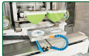
Programmable digital shuttle servo movement