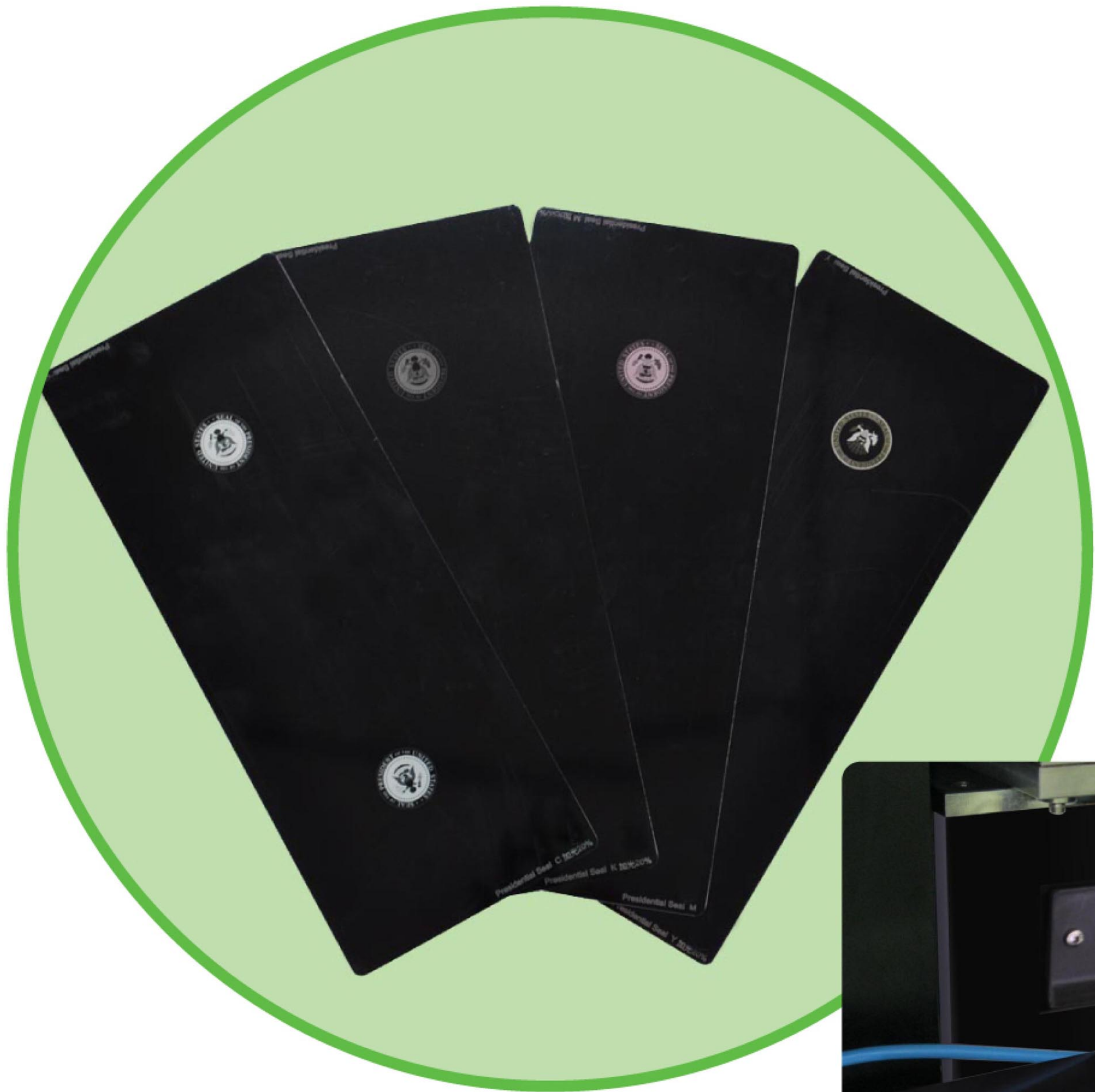
Green Plate (MGP) Low cost, easy handling