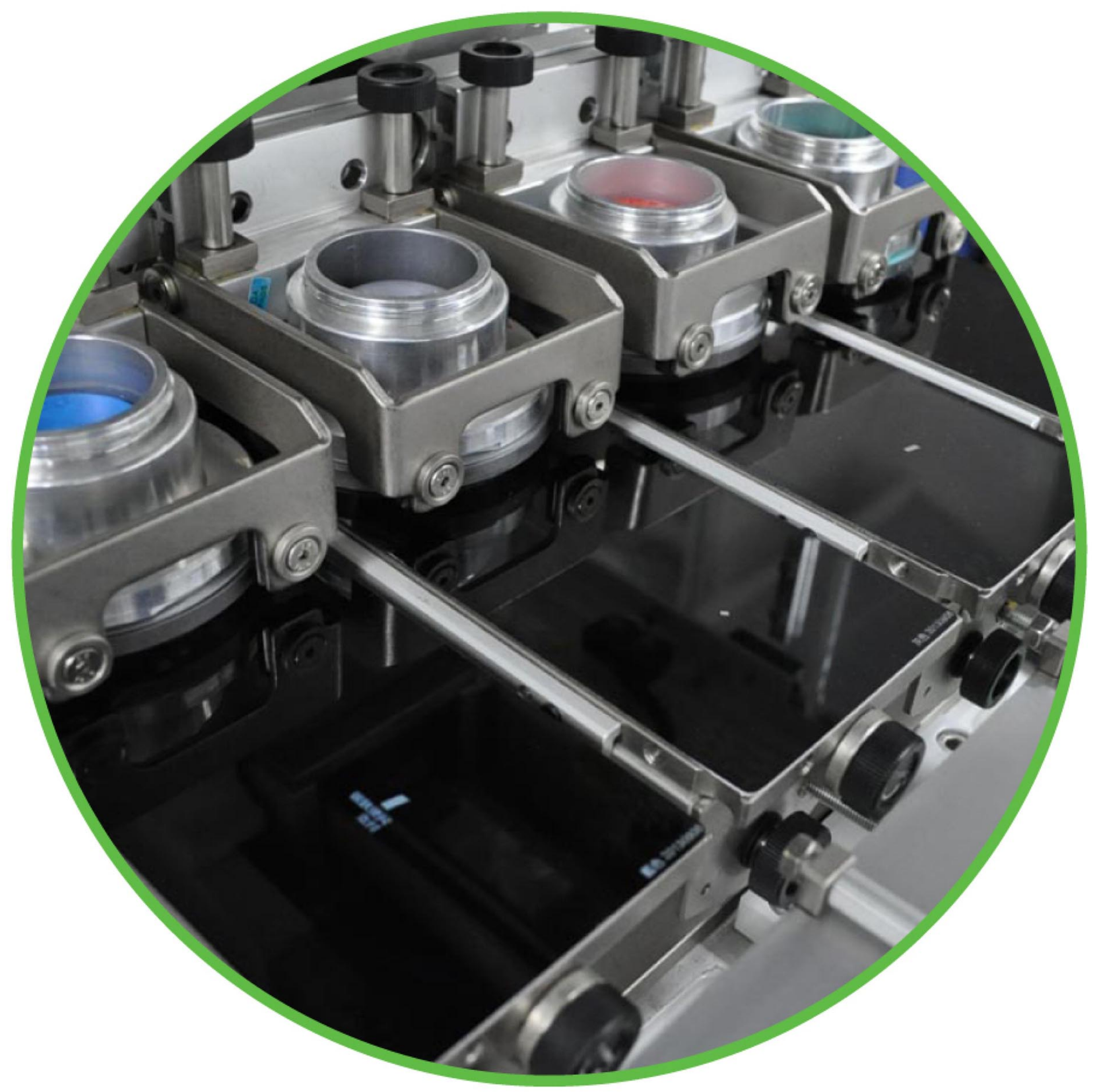
Green Cup No ink cleaning for job or color change