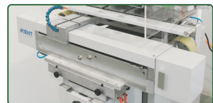
2-4 color Pneumatic Shuttle