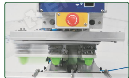
Pneumatic pad shuttle