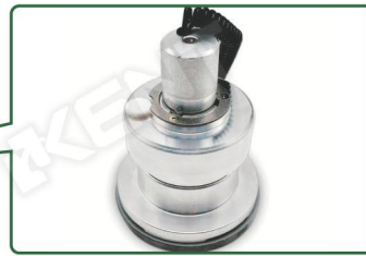
AVC - Automatic Viscosity Control (patented)