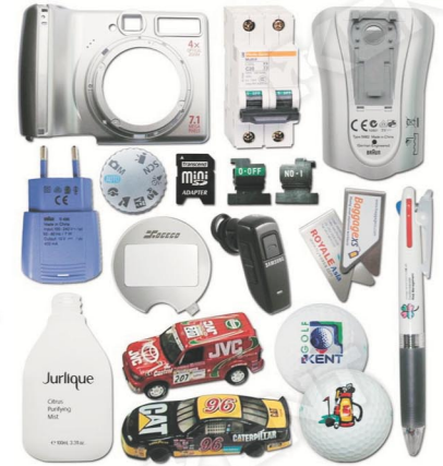
For promotional and industrial product printing