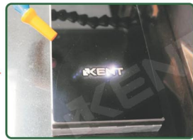
Laser engrave Green plate