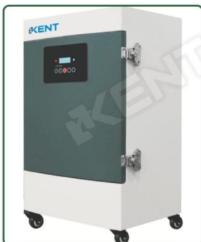
Fume extractor with professional filter