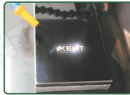
Laser engrave Green plate